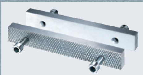
Overview of interchangeable jaws